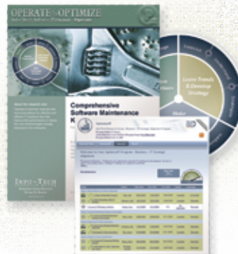
Research with a clear bottom line you can act on

Now you can rely on one source for tools, templates and advice that are created for practical application – IT research that finally works the way you work.